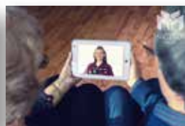
Remote Mobile Medical Service