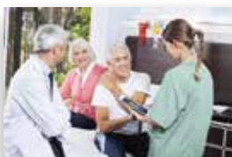
Medical & Healthcare