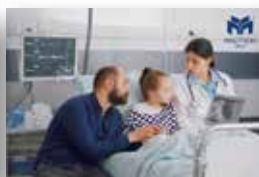
Daily Patient Management